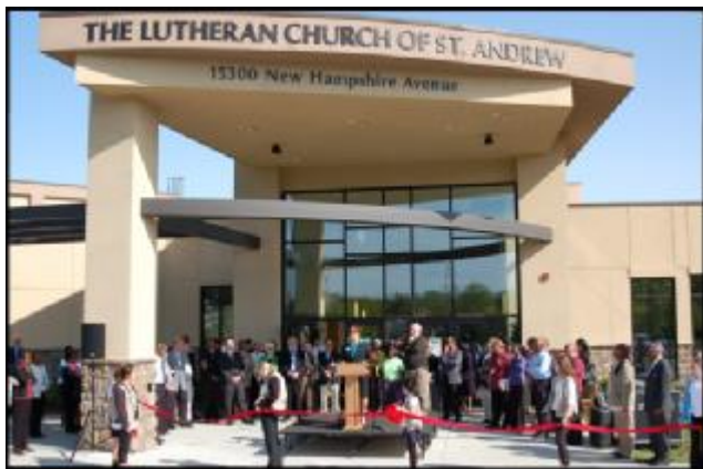
Ribbon Cutting Ceremony for the People-4-People Career Fair at St. Andrew on Saturday, April 17.

Our mission is to demonstrate God's love by caring for all people and helping them to know and follow Jesus.